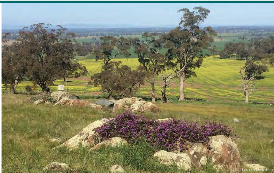
Native vegetation supports pollinators by providing food and nesting sites. Nearby crops and pastures will benefit from the increased abundance and diversity of pollinators in the landscape.

In Australia, honey bees, native bees and other native insects like hoverflies, wasps and butterflies provide essential pollination services for native plants, pastures, crops, fruits and vegetables.