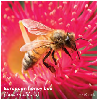
European honey bee ( Apis mellifera )