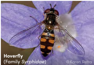
Hoverfly (Family Syrphidae)

A second set of wings are modified into club-shaped paddles that allow flies to hover and stabilize their flight. Unlike bees and wasps, they have very small, clubbed antennae at the front of their head. Flies feed on nectar, and many of them have hairy bodies that easily collect pollen while they are feeding. Flies are often attracted to flowers that smell carrion-like, and even blowflies will feed on nectar and are pollinators.