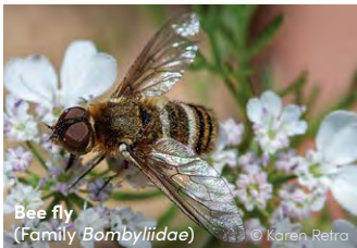
Bee fly (Family Bombyliidae)

Although many Australian native bees are generalist foragers, some species have co-evolved with native plants and adapted to be the most effective pollinators of their flowers. Plants such as Scaevola , Persoonia , Daviesia , Pultenaea and Swainsonia require special skills to access their nectar and enable the transfer of pollen to the stigma. Most native bees are solitary, but some species found in northern Australia ( Tetragonula sp. and Austroplebia sp.) are social bees and are used for commercial pollination of crops like macadamia nuts.