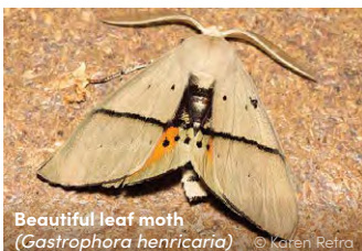
Beautiful leaf moth ( Gastrophora henricaria )

Butterflies have wings covered in tiny scales. They have clubbed antennae and hold their wings upright when at rest. They are day-flying and have long tongues that they can use to feed on nectar in flowers with deep tubes. Butterflies are usually brightly coloured.