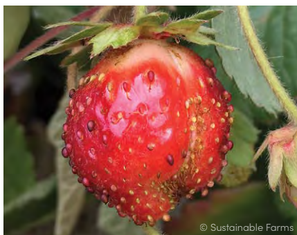
Under-pollination results in smaller, misshapen fruit such as this strawberry.

Insect populations are in decline worldwide due to land clearing, intensive or monocultural agriculture, pesticide use, environmental pollution, colony disease and climate change. Low pollinator numbers mean not all flowers are pollinated, leading to low fruit or seed set. This in turn reduces crop and pasture yields, farm profits and ultimately food supply.