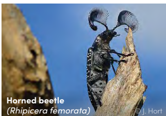
Horned beetle ( Rhipicera femorata )

Hoverflies are a type of fly, distinguishable by their large eyes, short antennae, bright black and yellow abdomen and their hovering flight behaviour. Adult hoverflies are nectar and pollen feeders. Hoverfly larvae feed on pests such as aphids, thrips and leafhoppers and are useful biocontrol agents.