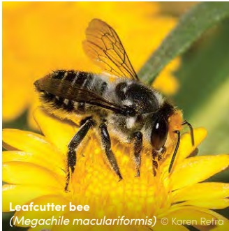
Leafcutter bee ( Megachile maculariformis )

Honey bees have become an important part of the Australian landscape. Honey bees live as colonies, and have a long history of coexistence with humans and co-evolution with agricultural farming systems. Hives can be transported by beekeepers to support crop pollination and to take advantage of flowering events to make honey.