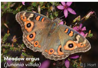
Meadow argus ( Junonia villida )

Beetles have hard outer wings that form their distinctive beetle shape. Their outer wings form a T-shape where they join at the top, unlike bugs where the outer wings make an X- or Y-shape. Beetles feed on nectar and pollen, usually by crawling over flower surfaces.